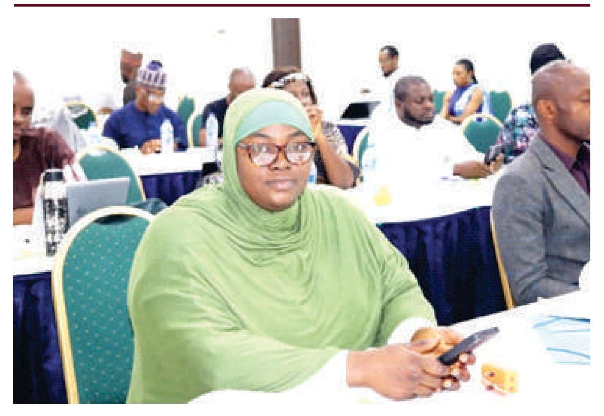
Participants of the TOT workshop