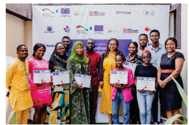
A cross section of participants that completed the training.