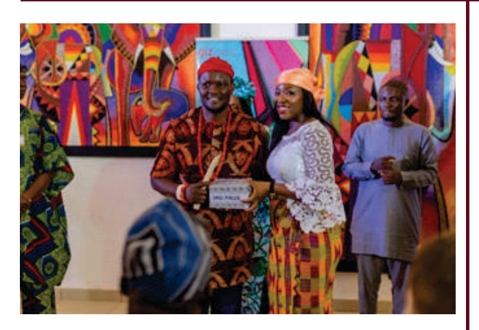
Award for most culturally dressed

Another event may have come and gone, but the bonds created, and knowledge shared will have a lasting impact. Together, we are on the journey to shaping a more diversity-compliant workplace.