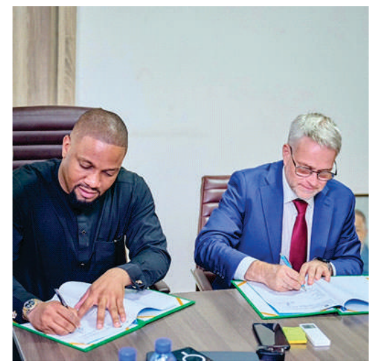
The DG of SMEDAN and the Cluster Coordinator of SEDEC signing the MOU