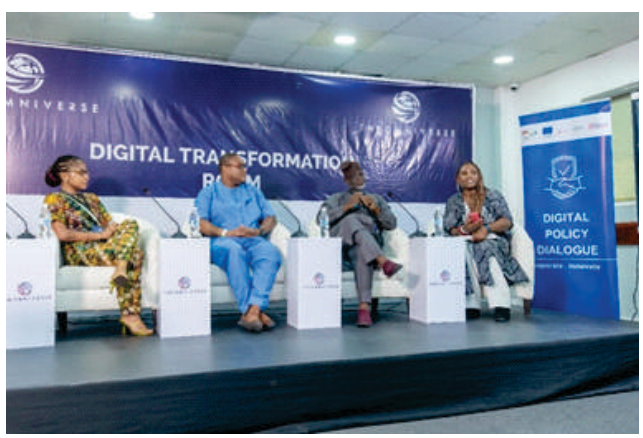
A Live Podcast Session on How MSMEs can Scale.