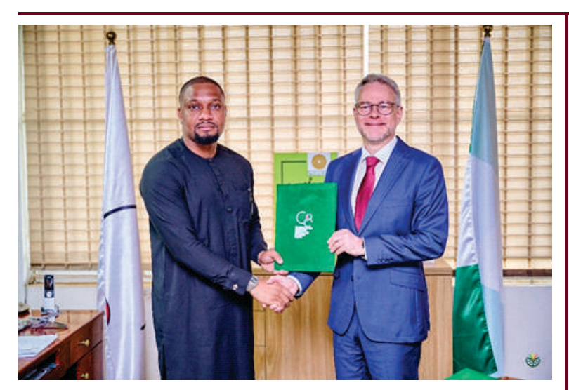
Signed partnership with SMEDAN and SEDEC GIZ

Learn more about GIZ's approach to MSME development on the website www.sedin-nigeria.net