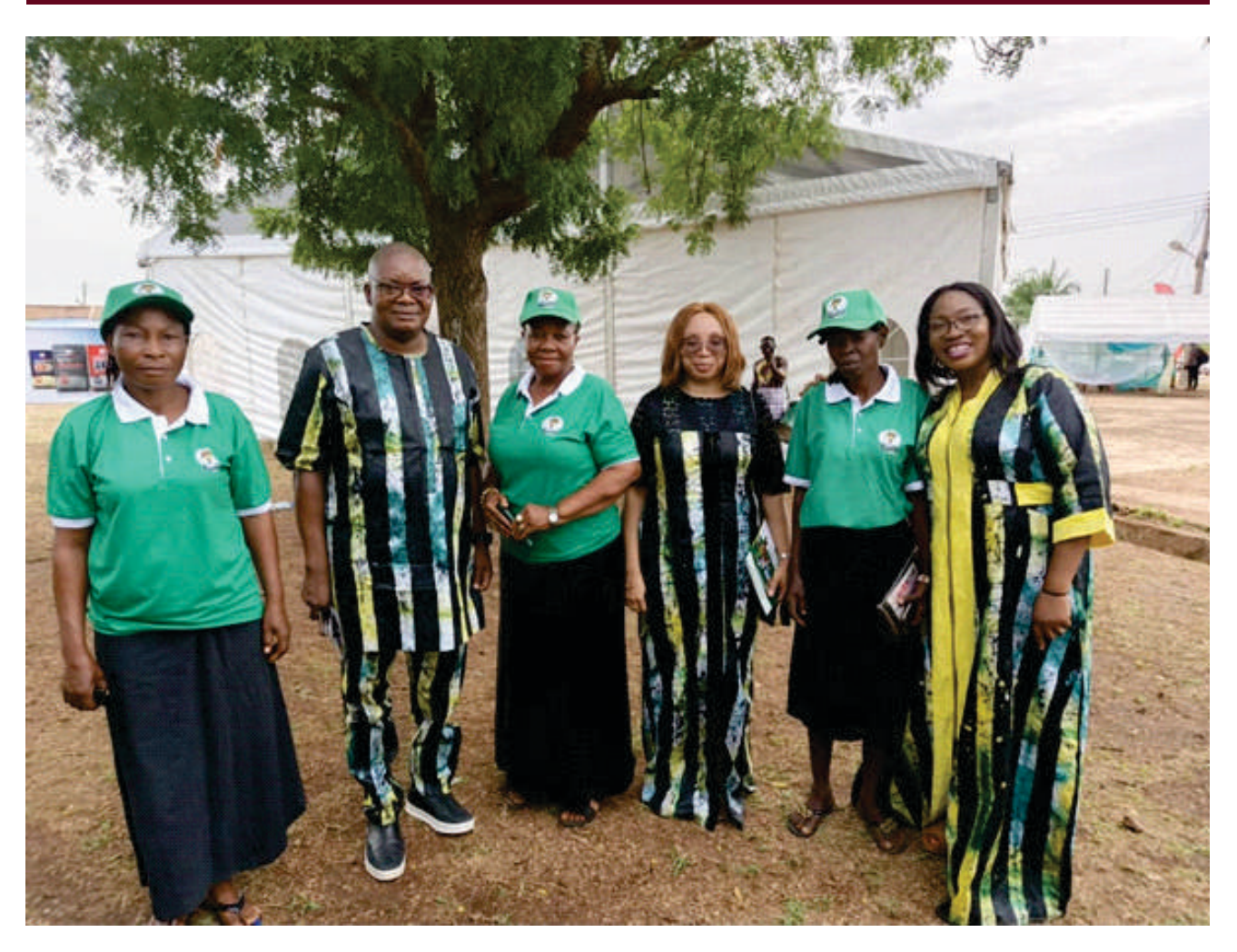
OGUN TRADE FAIR: MSMEs, GIZ and other stakeholders at the International Trade fair in Ogun state

More than just an exhibition, the 13th International Trade Fair in Ogun State was a celebration of innovation, collaboration, and economic potential. With the support of the SEDIN programme, MSMEs were able to expand their reach and address business challenges. As MSMEs continue to grow and thrive, they play a crucial role in shaping a vibrant and sustainable economic future for Nigeria.