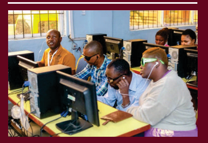
A picture of joy during the digital training