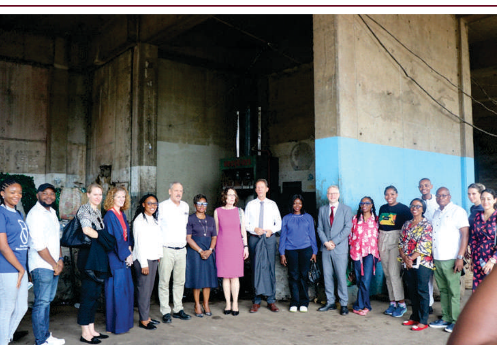
Visit to one of our partners in Circular Economy: Wecyclers

Other circular economy businesses present at the visit were MitiMeth, Quadloop, Clozetsales, and Circular Economy Innovation Partnership (CEIP).