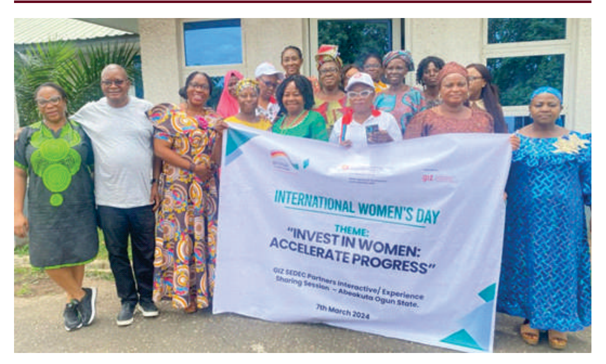
SEDIN and SKYE Gender Focal Persons with participants at the International Women's Day Event in Ogun State