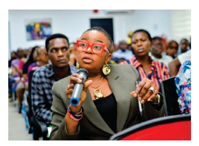
A staff member of the Migrant Resource Centre (MRC) of the Federal Ministry of Labour and Employment contributing to the topic of Regular Migration.