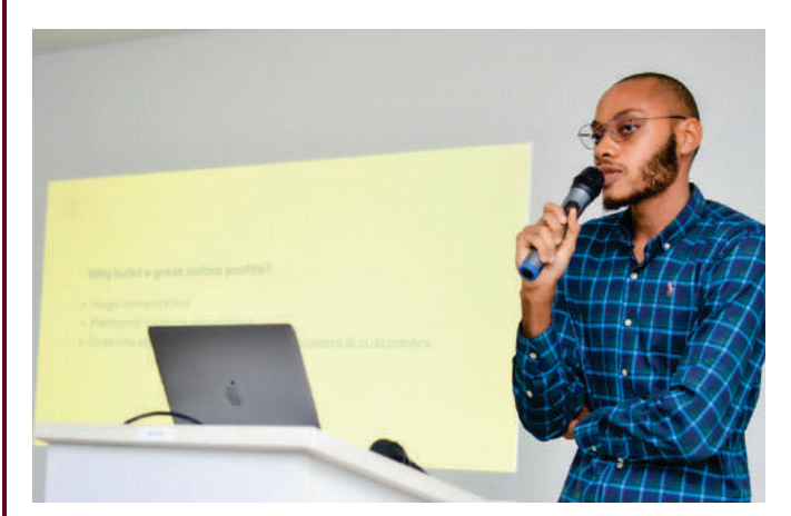
A consultant from Terrawork making a presentation on Standing Out Online