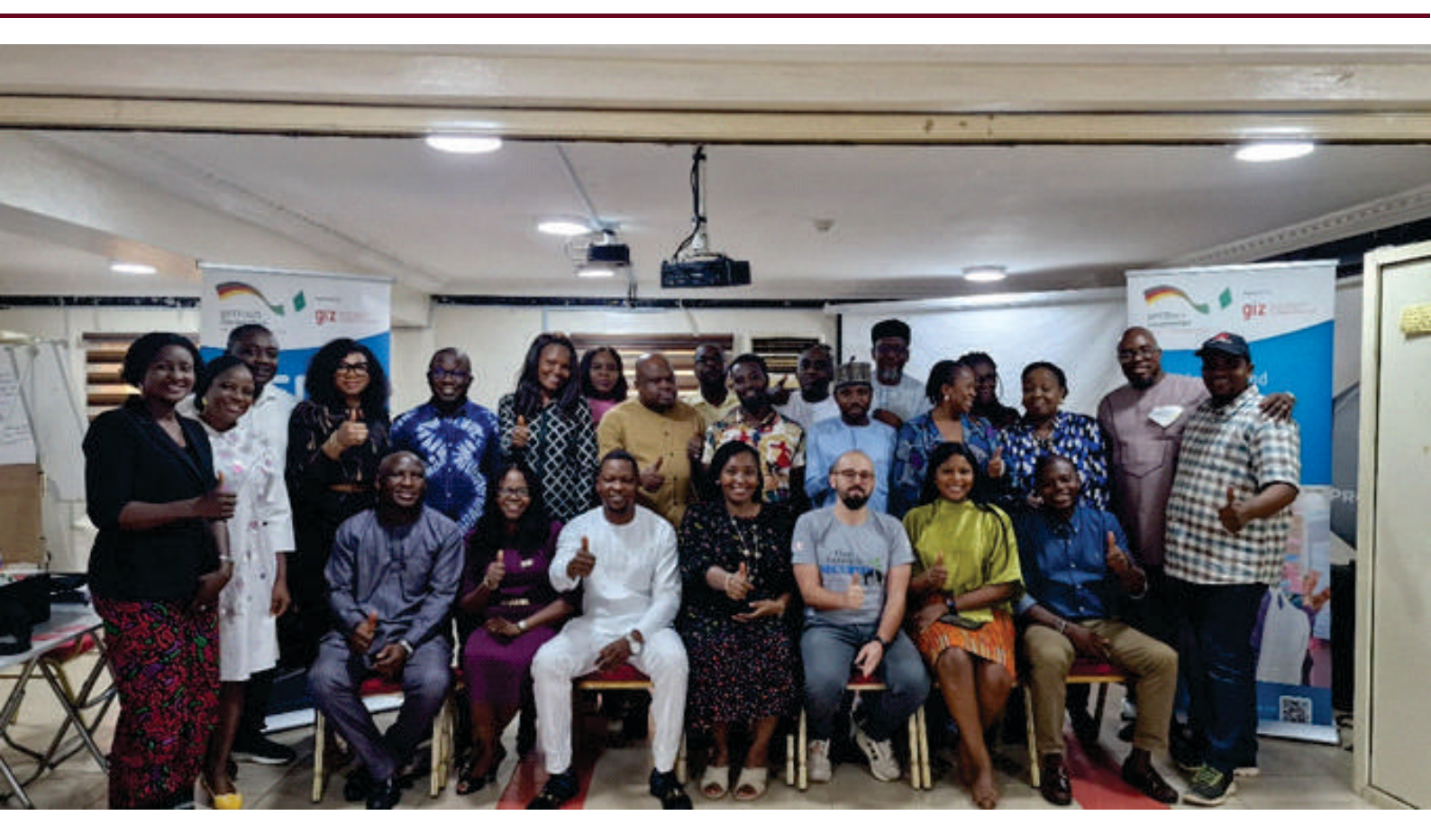
Focal persons from GIZ with SMEDAN Zonal officers

Click to learn more about the SEA-Hub project