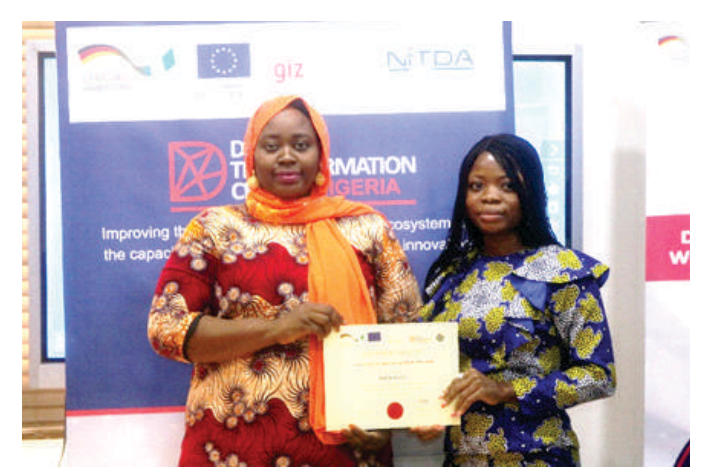
Certificate presentation at the Digital Optimization Training, Abuia