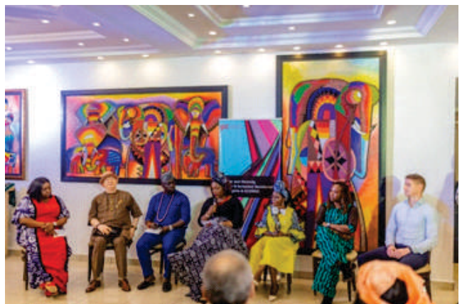
Panelists at the event