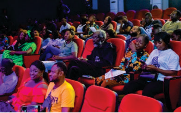
Participants engrossed in the movie at the premiere