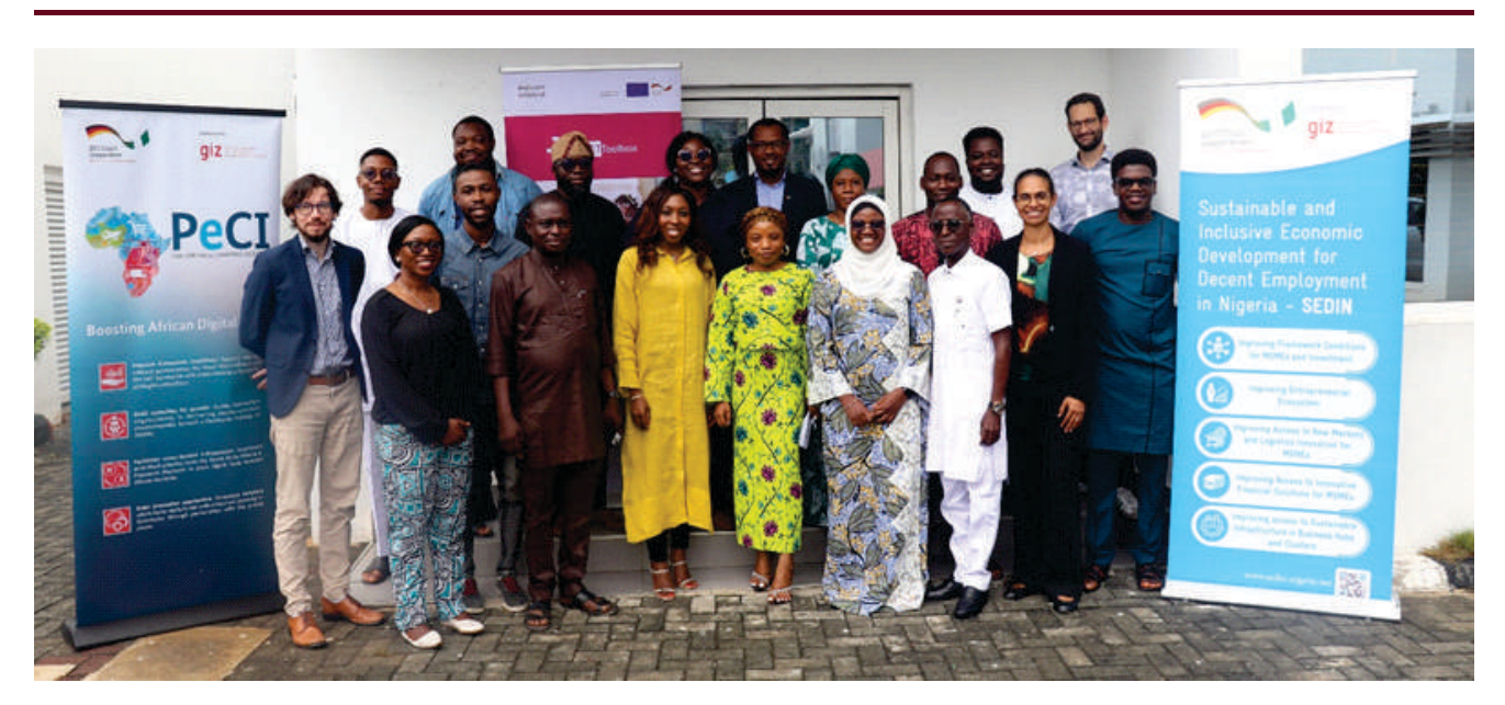
Focal persons from SEDEC and GEPF

The inaugural meeting of the Gig Economy Partners' Forum in 2024 marked a significant step forward in addressing the challenges and opportunities within the gig economy.