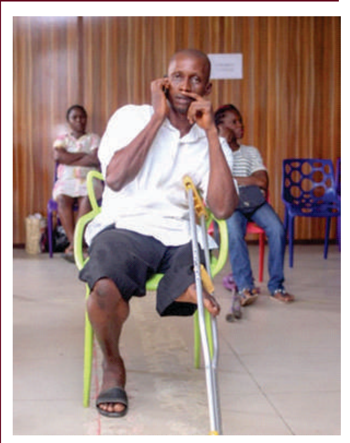
A participant at the training