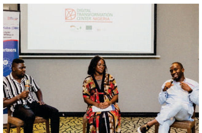
A fireside chat with a DIH Lead Partner