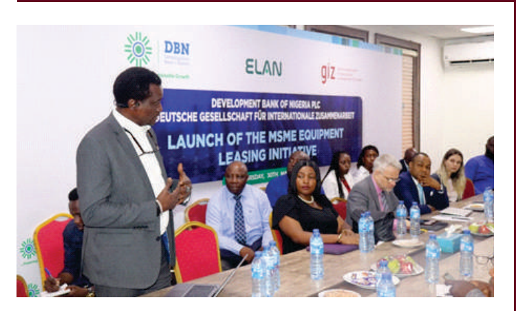
Information being shared about the MSME Equipment Leasing Initiative

This initiative underscores the commitment to creating a supportive ecosystem for MSMEs, driving economic growth, raising awareness, and promoting leasing as a feasible option for financing.