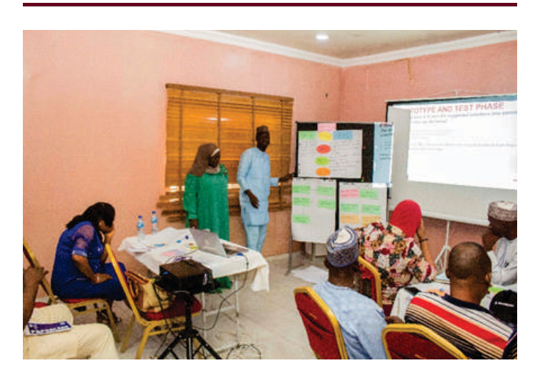
Focal persons from GIZ with SMEDAN Zonal officers

tailored to the needs of MSMEs selected clusters, hubs, and markets.