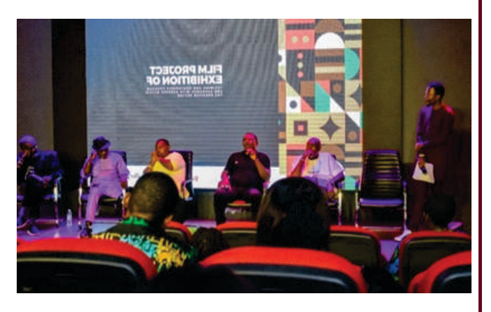
A plenary session with filmmakers at the event

Participants benefited from hands-on training and engagement with industry experts at local and national levels. This interaction not only enhanced their technical skills but also provided valuable insights into the processes of the film industry. The programme's success was underscored by the presentation of certificates to 103 individuals who completed the training and contributed actively to the short film projects, signalling their readiness for careers in filmmaking. Furthermore, the Edo State Creative Hub presented GIZ SKYE with a special recognition award for their continuous partnership. This acknowledgement highlights the pivotal role of collaborative initiatives in promoting employment growth and sustainability within the creative sector.