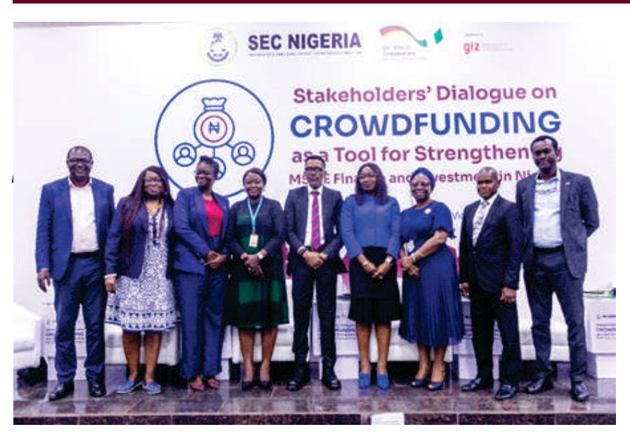
Panelists of Stakeholder dialogue session