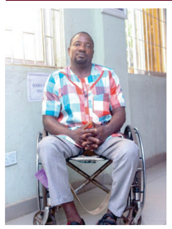
A participant at the training

The leatherwork training programme has significantly impacted the lives of the beneficiaries. 78 out of the 98 participants are already producing high-quality bags, footwear, belts, and more. Among these, three beneficiaries have come together to form a business partnership. These individuals are now earning from their skills and have improved their livelihoods, becoming active contributors to economic development.